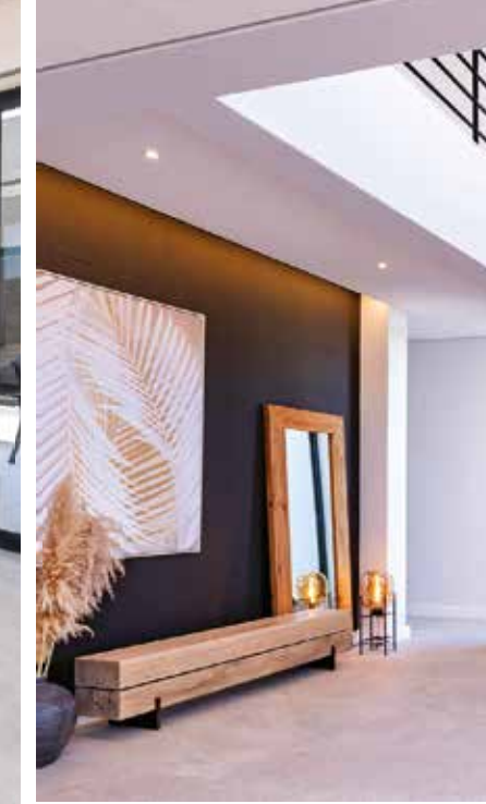
THERMO FIRES 021 200 7660

ABOVE: Manufactured from quality hot-rolled mild steel, the 1500 Delux built-in braai from Thermo Fires ensures the best in home entertainment. Offering smoke-free use, the braai is perfect for this indoor entertainment area. It is stylish and functional, with adjustable grids that make it possible to cook different meats simultaneously.